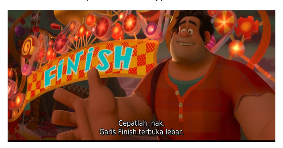
Picture 4.6 the scene when Ralph helps Veneloppe to get to the finish line.

According to picture 4.5, Ralph was return Venaloppe's car, Ralph feels guilty for wrecking the Veneloppe's car because of the influence of candy king. He asked Felix for help to fix the Veneloppe's car and return it.