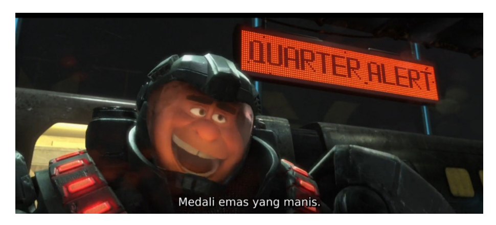
Picture 4.2 The scene when Ralph disguised himself as another character

According to the picture 4.2 when Ralph tries to get into other game to get that medal by posing as a character in the game.