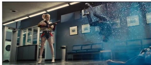
Figure 9 Harley uses colorful bullets

In Feminism struggling does not mean being hard on ourselves but we also have to look at the situation in order to solve the problem. When Roman Zionist gives Harley a chance to find the diamond and set it free Harley said “Call me old-fashioned, but I always thought the guy was meant to get the girl a diamond.” From the statement it is implied that men should bring diamonds for women, but not what Harley Quinn should do. She had to find diamonds to turn over to the Roman Zionists. This proves that the Zionist army consisting of men was unable to get the diamond in Cassandra's hands, so Harley needed to intervene to get it. Harley is also being sought by the police for one of her actions. Although Harley had to stealthily look for the diamond that Zionists wanted, Harley passed it casually. She continued to do so madly and carelessly.