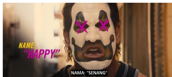
Figure 7 Mr. Happy who wants to catch Harley Quinn

In pursuit of Renee Montoya, Harley said “Since my little stunt at Ace Chemicals announced to the world that Mr. J and I were dunzo. The immunity I'd enjoyed, for so long was gone. Cops who never would've dared come after me before were suddenly doing this.” Even so Harley still escapes and proves her ability to survive without the influence of the Joker. While she was still being chased by police Renee Montoya for her crimes, each of the people she had harmed attacked her. The first is a Dummy Roller whose nose was broken by Harley Quinn during an ice skating match. The second is Ralph Murray who was bitten by her new Hyena. And the last one is the driver of Roman Zionists because Harley has broken his leg. Harley hangs on to the roof of the building using both her hands with a smiling expression after successfully escaping from Renee, Ralph Murry and Roman Zionist's driver who chases her. When she thought she could escape from the people chasing her, it turned out that there was still Mr. Happy waiting for her because of cosmetics vandalism (in frame 7)