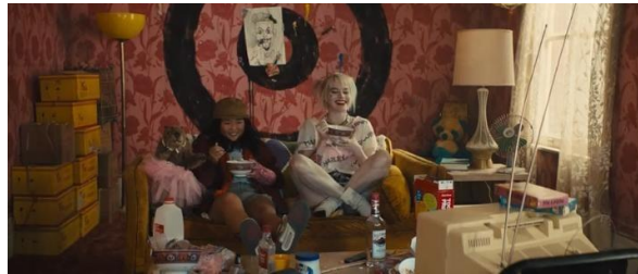
Figure 10 Harley treats Cassandra well

compassion when she wants to make a decision. This can be seen from Harley Quinn's actions when she was about to take the diamond contained in Cassandra Cain's body. Harley treated Cassandra well when she kidnapped her from prison (in frame 10)