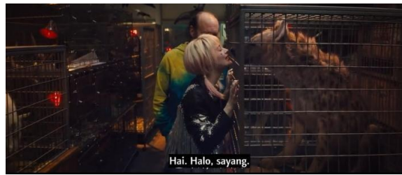
Figure 2 Harley in animal shop

When a person experiences deep sadness then she will find a way to heal her inner wounds, by doing something pleasant. Everyone has a different way of healing their mind. So that each person must recognize herself and see what must be done to speed up the process of inner healing and start a new life. In this scene, Harley is a person who recognizes herself so that she can choose what to do, that is by adopting a Hyena.