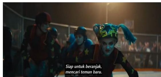
Figure 3 Harley playing skating with her new friends

In this scene Harley said “But after a while, I even opened myself up to the possibility of new love”. Harley Quinn also started her new life by making new friends and doing new activities. She goes to an ice skating match to try to forget her troubles (in frame 3)