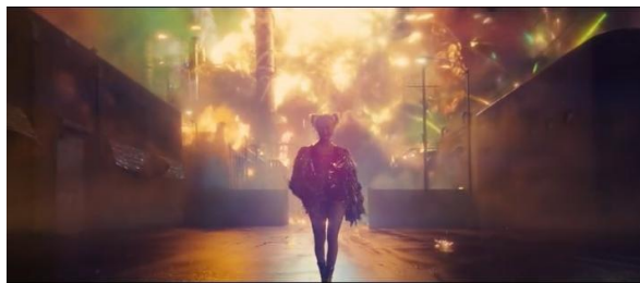
Figure 5 Harley Quinn blowing up the chemical factory to declare her breaking up with Joker

Hearing the gossip of her friends Harley is very sad to be underestimated, but she proves her independence by finding a new identity. Harley Quinn, who was so devastated, wanted to show her emancipation that she could be alone without the Joker's protection. While she was drunk, she got a crazy idea that is blowing up a chemical factory where Joker and Harley start their love story. The chemical factory is where the love story of Harley Quinn and the joker begins. In order to erase the traces of their love story and throw away the good memories with Joker, she closes her messy relationship by throwing away her J necklace and crashing an oil truck driving into a chemical factory where she drown with Joker, causing it to explode and the entire factory catches fire (in frame 5).