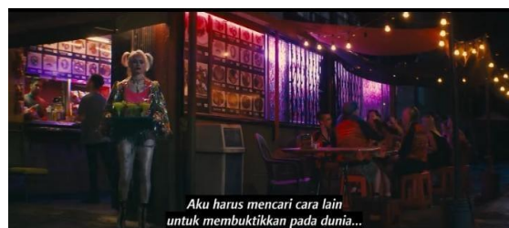
Figure 4 Harley is underestimated by her friends

After Harley Quinn breaks up with Joker, she still uses the Joker name for the sake of the immunity she gets.