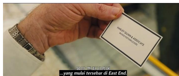
Figure 15 Business card with new identity of Harley Quinn

Finally, after defeating Zionist and getting the diamonds exchanged for money, she finally found what she wanted to do, she founded her own company. There is no mention of what Harley Quinn's business is, but she finds that her company is called "Harley Quinn & Associate", as shown in the business card at the end of the story (in frame 15)