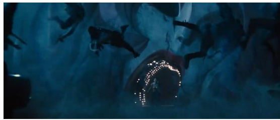
Figure 12 The voice of Black Canary defeating the enemy

Seen the sound of the black canary was able to defeat the Zionist and make the Zionist troops bounce. Cooperation and mutual trust are very visible in this film like what did Renee Montoya said to Harley “Don't let them catch kid, I trust you.” From the dialogue, Renee Montoya gives a gun with one bullet to Harley. Renee trusts Harley if she will use the gun well. By working together and trusting each other that Harley Quinn and her friends do, they can defeat the Zionists. This success proves that the power of women cannot be underestimated. Even against a Zionist army consisting of a group of men, women who are considered weak actually have an inner strength that can defeat anything if used properly and cooperated.