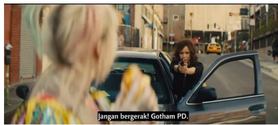
Figure 6 Harley being chased by police Renee Montoya

In pursuit of Renee Montoya, Harley said “Since my little stunt at Ace Chemicals announced to the world that Mr. J and I were dunzo. The immunity I'd enjoyed, for so long was gone. Cops who never would've dared come after me before were suddenly doing this.” Even so Harley still escapes and proves her ability to survive without the influence of the Joker. While she was still being chased by police Renee Montoya for her crimes, each of the people she had harmed attacked her. The first is a Dummy Roller whose nose was broken by Harley Quinn during an ice skating match. The second is Ralph Murray who was bitten by her new Hyena. And the last one is the driver of Roman Zionists because Harley has broken his leg. Harley hangs on to the roof of the building using both her hands with a smiling expression after successfully escaping from Renee, Ralph Murry and Roman Zionist's driver who chases her. When she thought she could escape from the people chasing her, it turned out that there was still Mr. Happy waiting for her because of cosmetics vandalism (in frame 7)