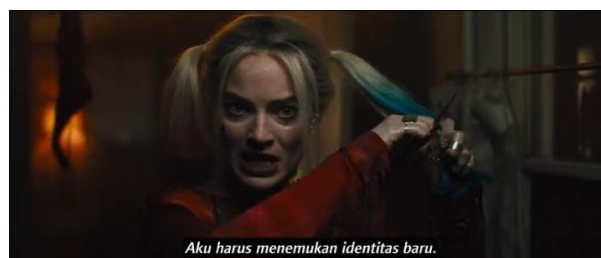
Figure 1. Harley Quinn cutting her hair declaring her path of new self-discovery.

At the beginning of the movie, she cut her hair short, as if she was about to break away from the past and start again (in frame 1).