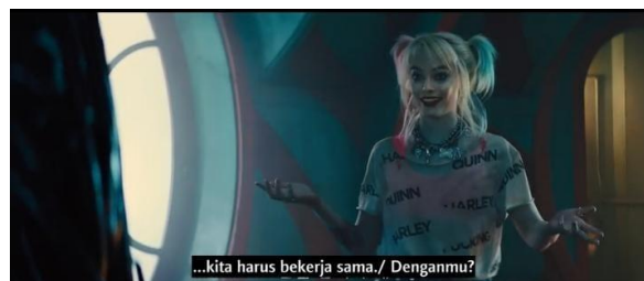
Figure 11 Harley Persuade her friends to work together Source : Screenshot of the screen

Harley Quinn and other women accidentally meet in a building where she will hand Cassandra to Zionists, feeling they have the same goal, they work together. Of course to face the oppression of Roman Zionist and his accomplice Victor Zsasz (in frame 11)