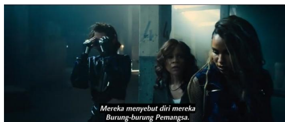
Figure 13 Birds of Prey against criminals

After the Zionists died, Harley Quinn and her friends decided to clean up Gotham City from the inside and outside. Seen when they carry out their actions to fight criminals (in frame 13)