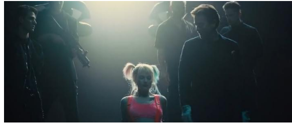
Figure 8 Harley caught by Roman Zionist

Having no protection from the joker, Roman Zionists thought it would be easy to kill Harley. As in his statement “I wanna kill you, because without the joker around, I can. For all your noise and bluster, you're just a silly little girl with no one around to protect her.” But in her arrest Harley did not give up, she tried to persuade the Roman Zionists by offering to help find the lost Zionists item that is diamond.